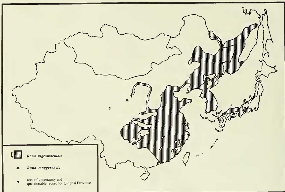
FIG. 2. The distribution of Rana nigromaculata and Rana tenggerensis . The question mark between Rana nigromaculata and Rana tenggerensis represents an area of uncertainty. The other question mark to the southwest of Rana tenggerensis represents a questionable record from Qinghai Province.